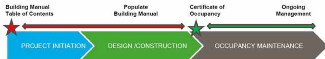
Building Manual Preparation Timetable (figure3)

The latest time the preparation of the Building Manual should commence is 30 days after work starts on site. This should allow the Design and Development team time to assemble their information for the pre-build phases. It also ensures the contractors have a clear guide on what is needed, where it is to be placed and no excuse for any delays at completion.